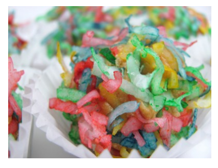
Peanut Butter Fireworks Ingredients Peanut butter balls 1 cup Peanut Butter 1 cup Dry Milk Powder 1/2 cup Honey

"A Dog's New Year's Resolution: I will not chase that stick unless I actually see it leave his hand!"