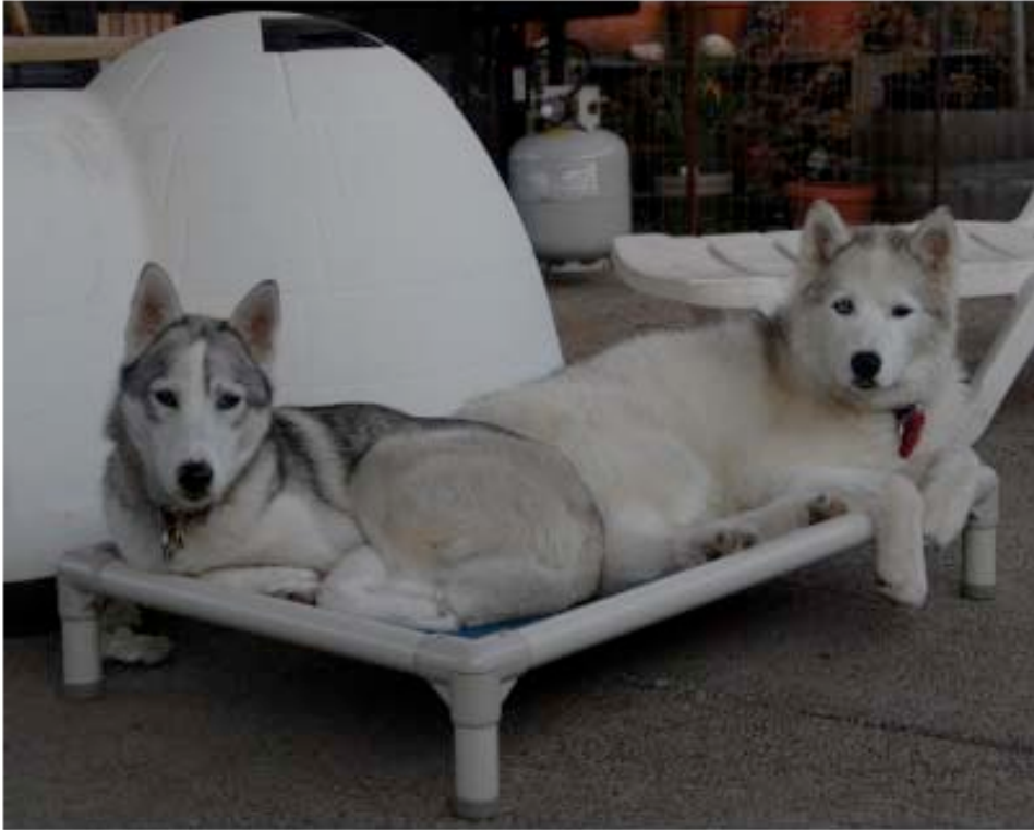
Happy Huskies - The girls love this bed, they each have one, but they seem to like to share one.

We would like to thank all the people who voted for Tehya and Faith in the Kuranda Dog Of The Week contest. With the win Kuranda donated a bed to BASH rescue.